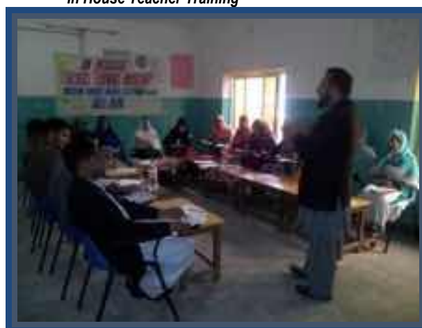
AST busy in In-house Teacher Training