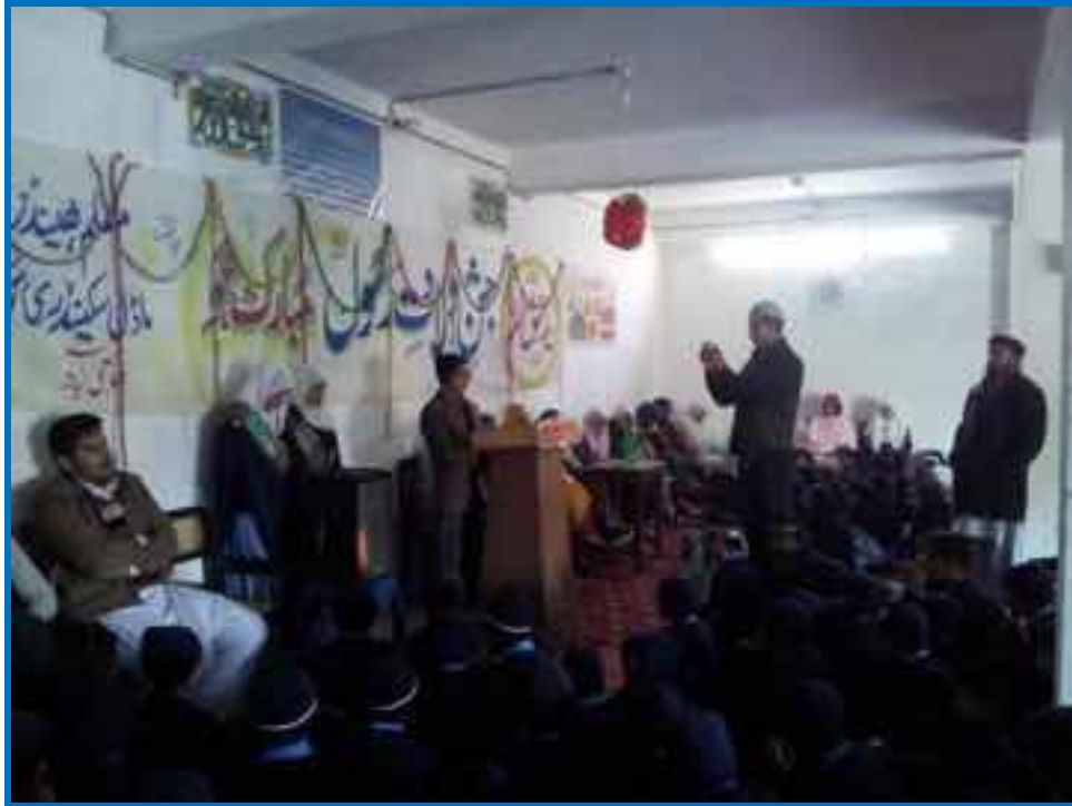
Students performing in Milad- E- Nabi Program