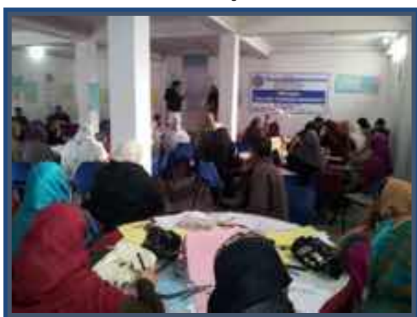
Group Activities during training workshop