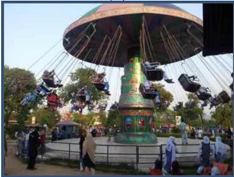
Students enjoying study trip