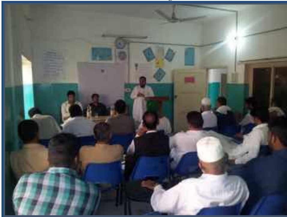
Principal Speech with student's parents.