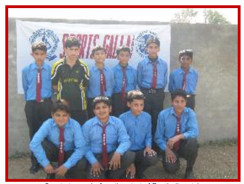
Sports teams before the start of Football match