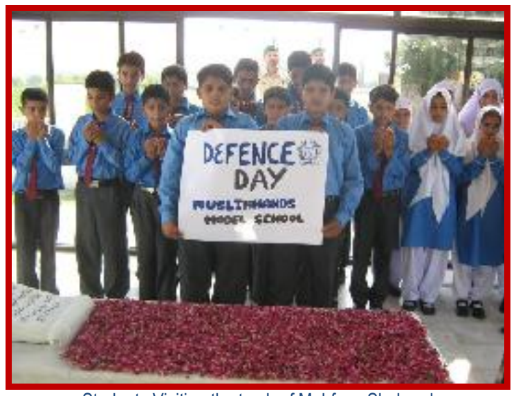
Students Visiting the tomb of Mahfooz Shaheed