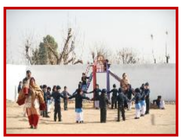
Safe Play Area