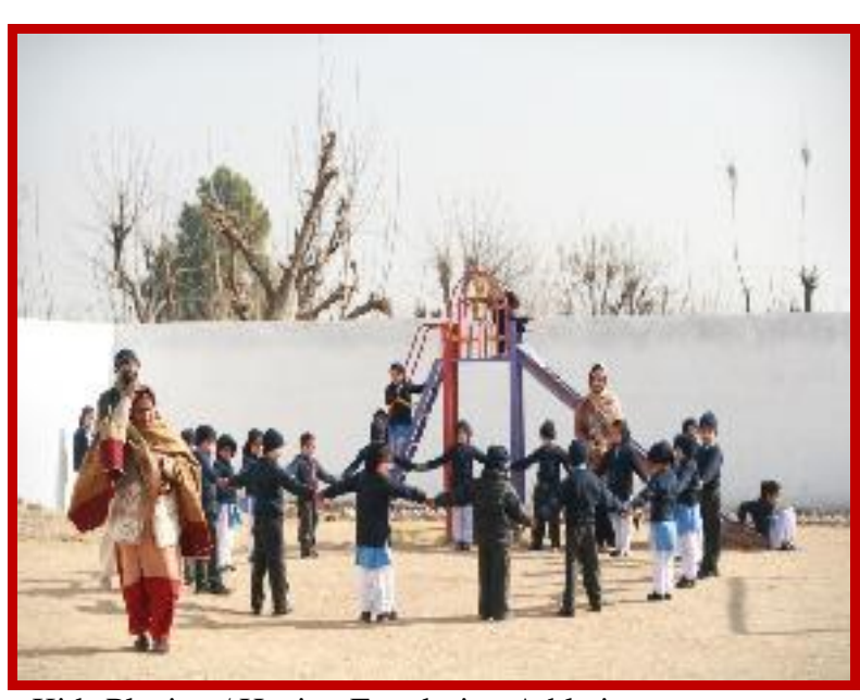
Kids Playing / Having Fun during Athletics