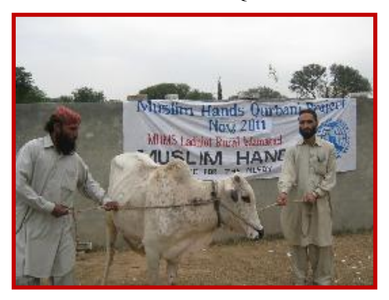
Preparations for Qurbani